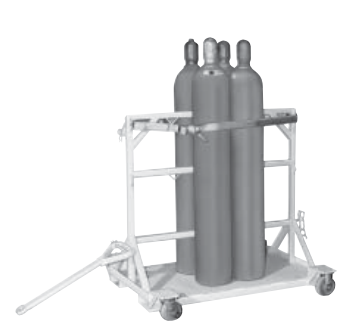
A security strap is standard on all 300 Series Kaddy-Karts, including KK300CT.