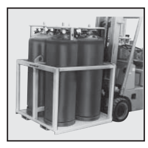
KK600 may be handled by fork lift or crane.